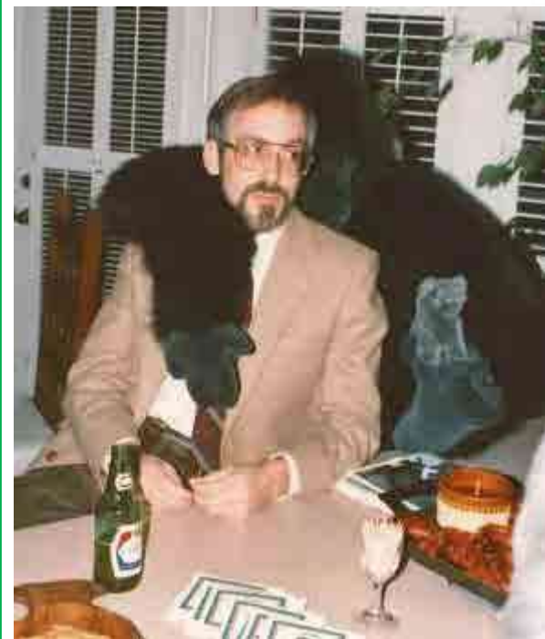
1990 Faculty Christmas Party