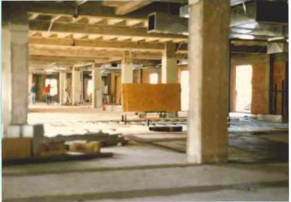
Terrill Hall (1986)