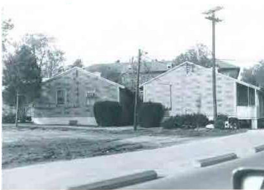
SIU Counseling Center (Site of assistantship in 1966)