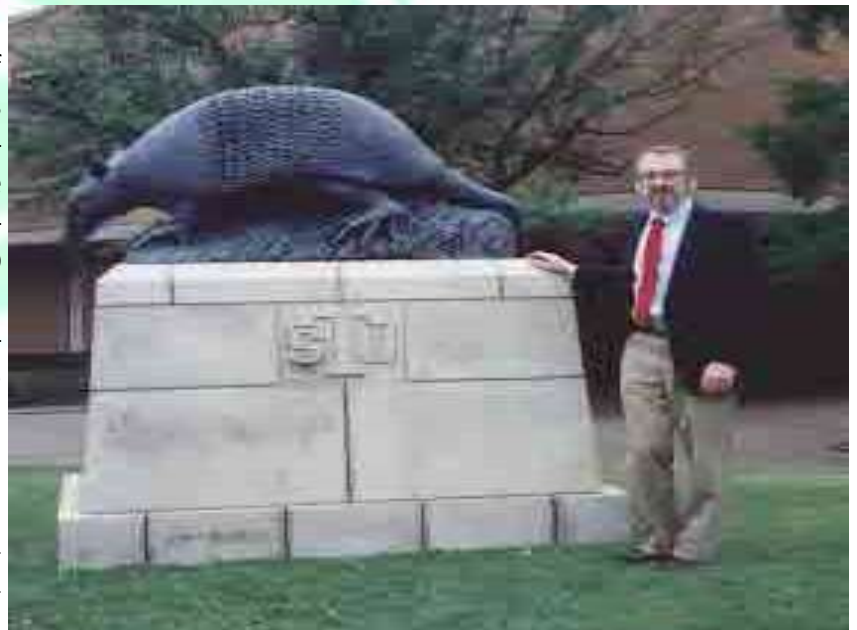
Monument before Eagle Statue AND a prop for “Necessary Roughness” (1993) filmed on campus

My entry to UNT (or NTSU at that time) was unconventional..... After working over a year at the psychiatric hospital, I began looking for another position in a more urban area. An SIU professor told me about an opening at NTSU and I received an invitation to interview. Having never been to Texas, my familiarity with Texas was pretty much limited to what I had seen in the film Giant and the TV serial Tales of the Texas Rangers (not to be confused with the team at the Ball Park in Arlington). I was unsure what to expect. Denton seemed reminiscent of Carbondale – a small college town some distance from any metropolis. Denton had only a few traffic lights and they were all on University Drive; Denton’s finest steak house was K-Bobs on University; and the finest hotel was Holiday Inn (which the department could not afford for hosting job applicants). In summer of 1972, I was offered a faculty position right in the departure lounge at Love Field after my interview. But I begged off making a decision on the spot. Few know that I actually turned down the offer after returning home and mulling over the offer for a couple of days . . . . But as fate would have it, I accepted the re-offer a few months later and arrived for the 1973 spring semester. In retrospection this evolution of events keeps my curiosity piqued about the place of “accidental theory” in vocational psychology.