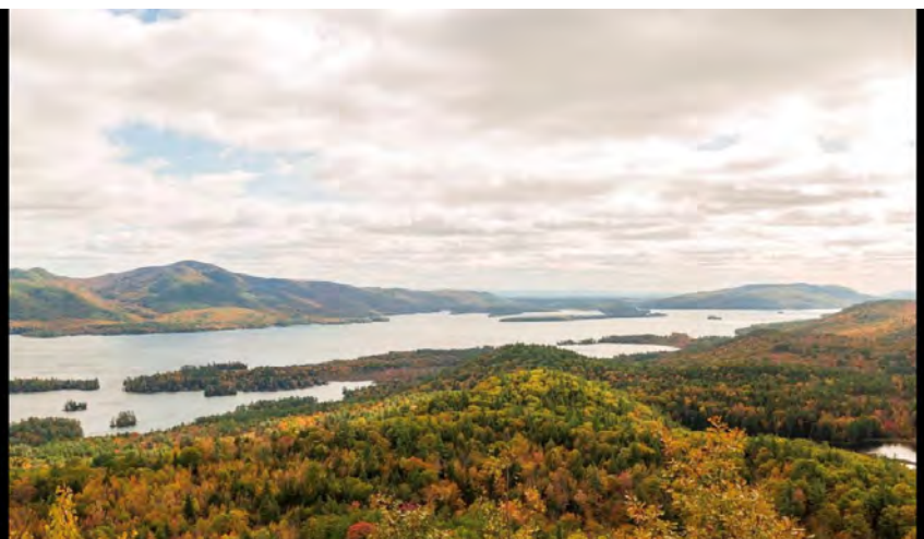
View of Lake George, NY in October