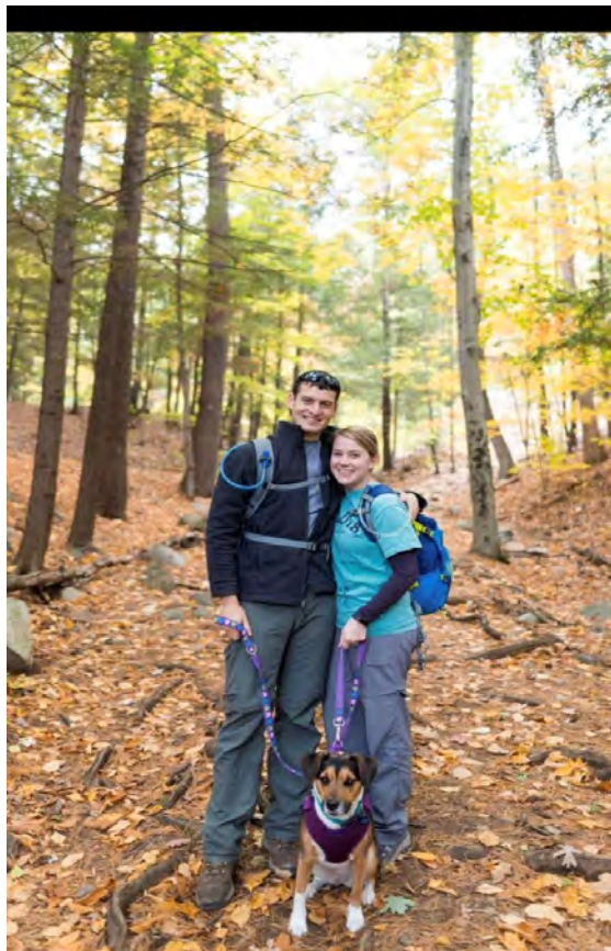
Family outing near Lake George, NY

Research – DONE!!! I successfully defended my dissertation on February 14 th , so my official obligation to research has ended. However, I am very proud of the work my team and I did, and I want to publish the results as soon as possible. The goal of my dissertation was to develop interpretation guidelines for the Complex Trauma Inventory ( https://psychology.unt.edu/cti ), the first publicly-available, self-report instrument that assesses the International Classification of Diseases' (ICD-11's) definition of PTSD and Complex PTSD. In order to do this, my team and I developed the Clinician-Administered Interview for Trauma Disorders (CAIT), a structured clinical interview protocol that can be used to diagnose the ICD-11 trauma disorders. The development of the CAIT was one of the most challenging but rewarding projects I have ever participated in. From my count, I had 3 licensed psychologists and 11 graduate students provide valuable feedback to improve the development of the CAIT. Y'all rock!