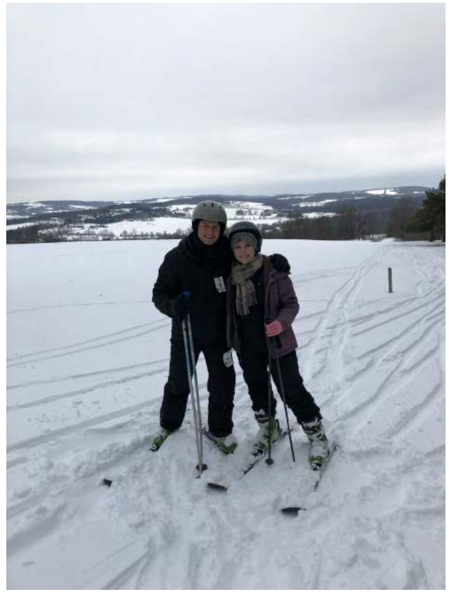
My first time skiing in NY